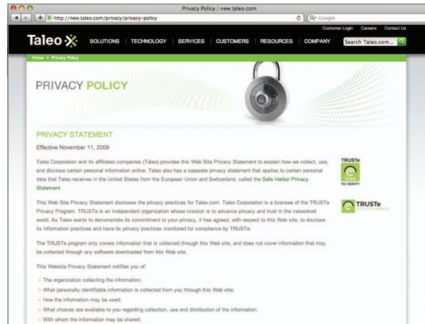
Taleo's privacy statement highlights its TRUSTe Web Privacy and EU Safe Harbor certification